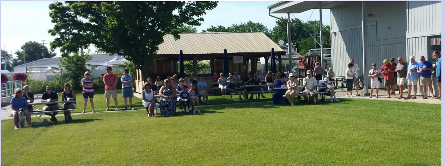
Top: Unfortunate situation for Commodore and P/C Middle: Memorial Day gathering Right & bottom: New security fencing at storage lot