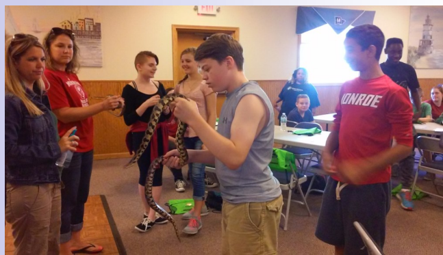
CCEC Students at Environmental Career Day