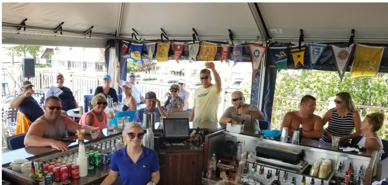
MBC members at the July cruise to Catawba Island Club