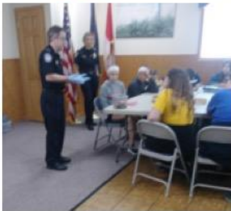
MBC—U.S. Customs & Border Protection with collection of bugs and dog demonstration. Didn't have time to take pictures of students and snakes and measuring water quality.