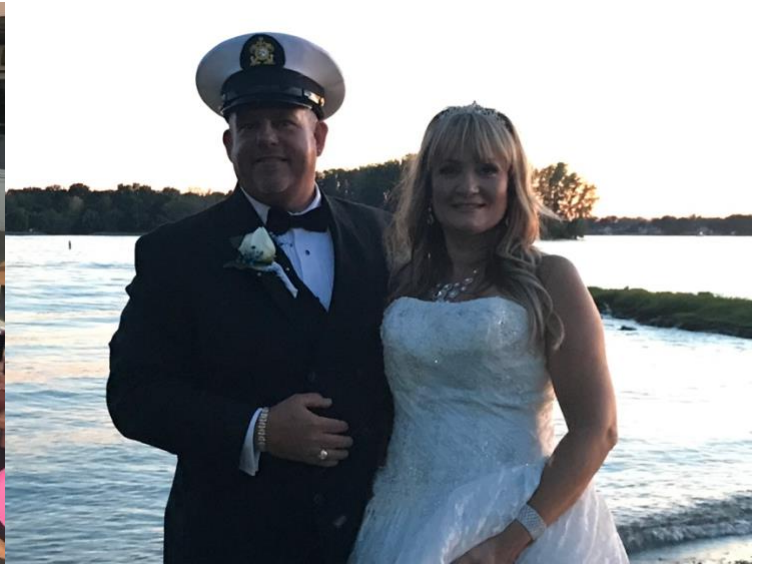
1 bride, 1 groom