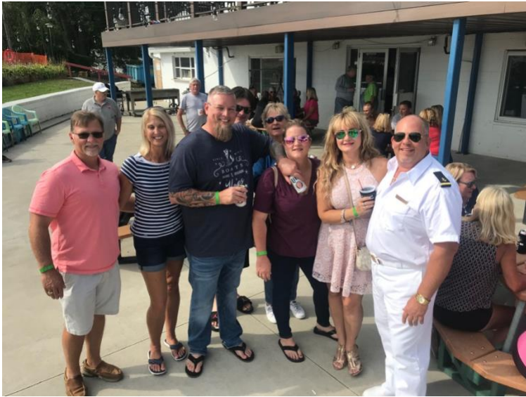
MBC at DBBC