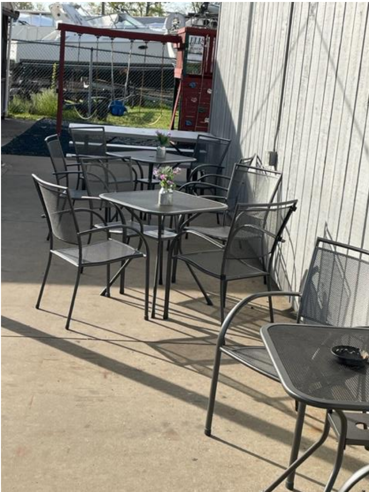
Come on out and enjoy the new patio furniture donated by the Sail Fleet!