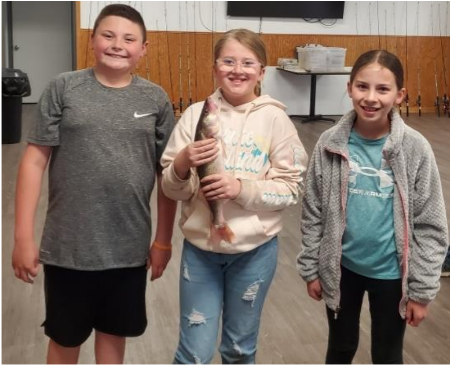
Gradeschool Fishing Club caught a big one on the last class of the semester at MBC!