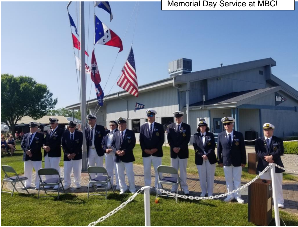
Memorial Day Service at MBC!