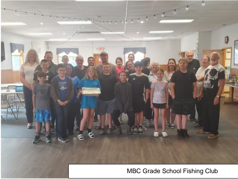
MBC Grade School Fishing Club